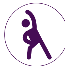
Get Moving, Get Healthy