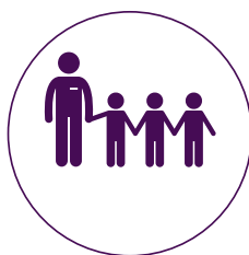
Keeping Children Safe in Education 2022

Hopwood College's student domain's top courses include: