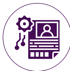
Managing Your Professional Digital Profile